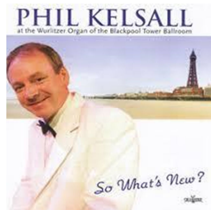
Some recent CD titles....