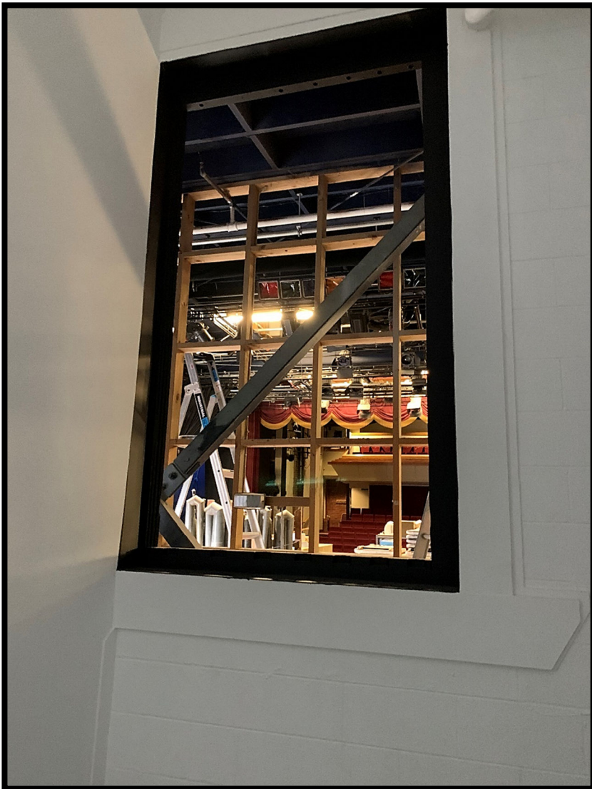
Looking through the Swell Shutter opening of what will be the "Main Chamber". The seats in the auditorium are just visible in the background.