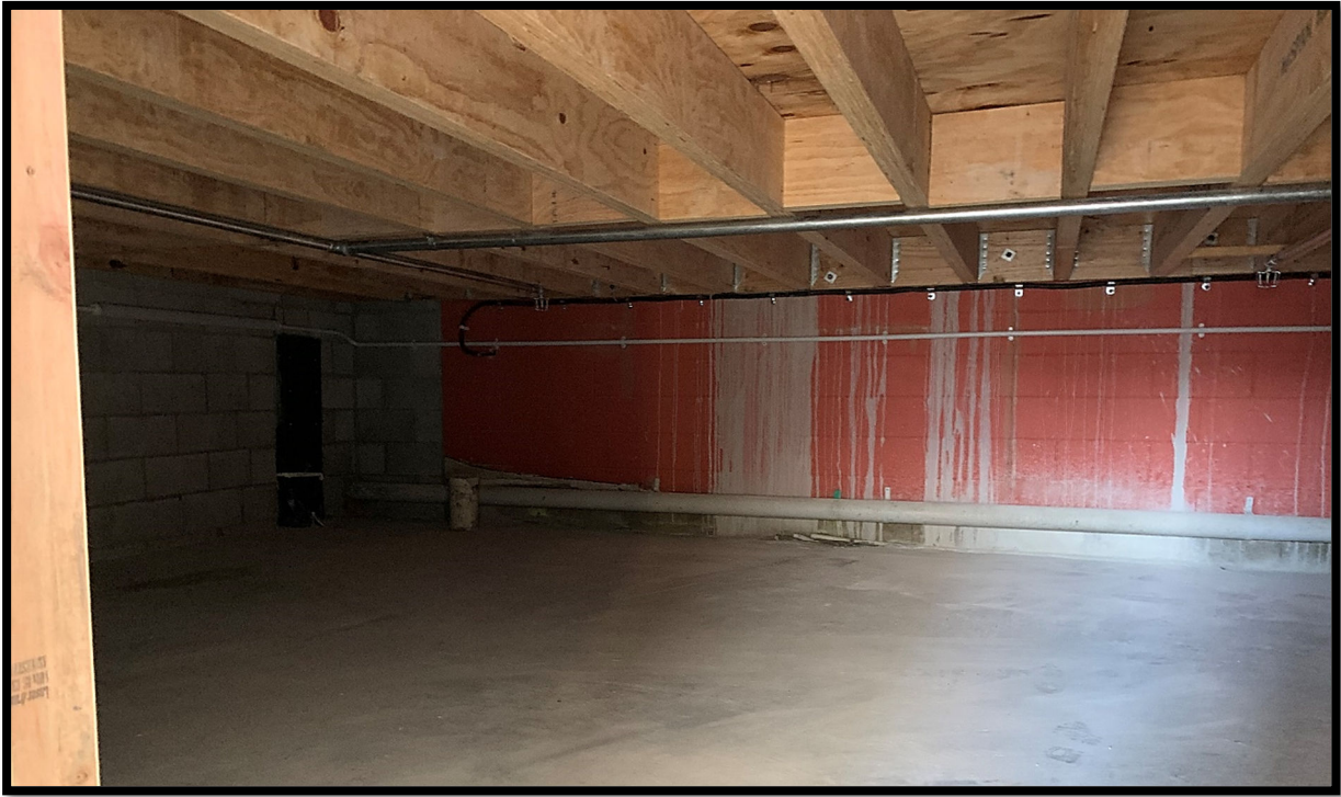
The Regulator Room under the pipe chamber which will hold the tremulants and wind regulators.