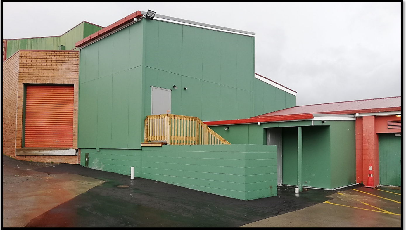
An exterior view of the new Organ Chamber Annex.