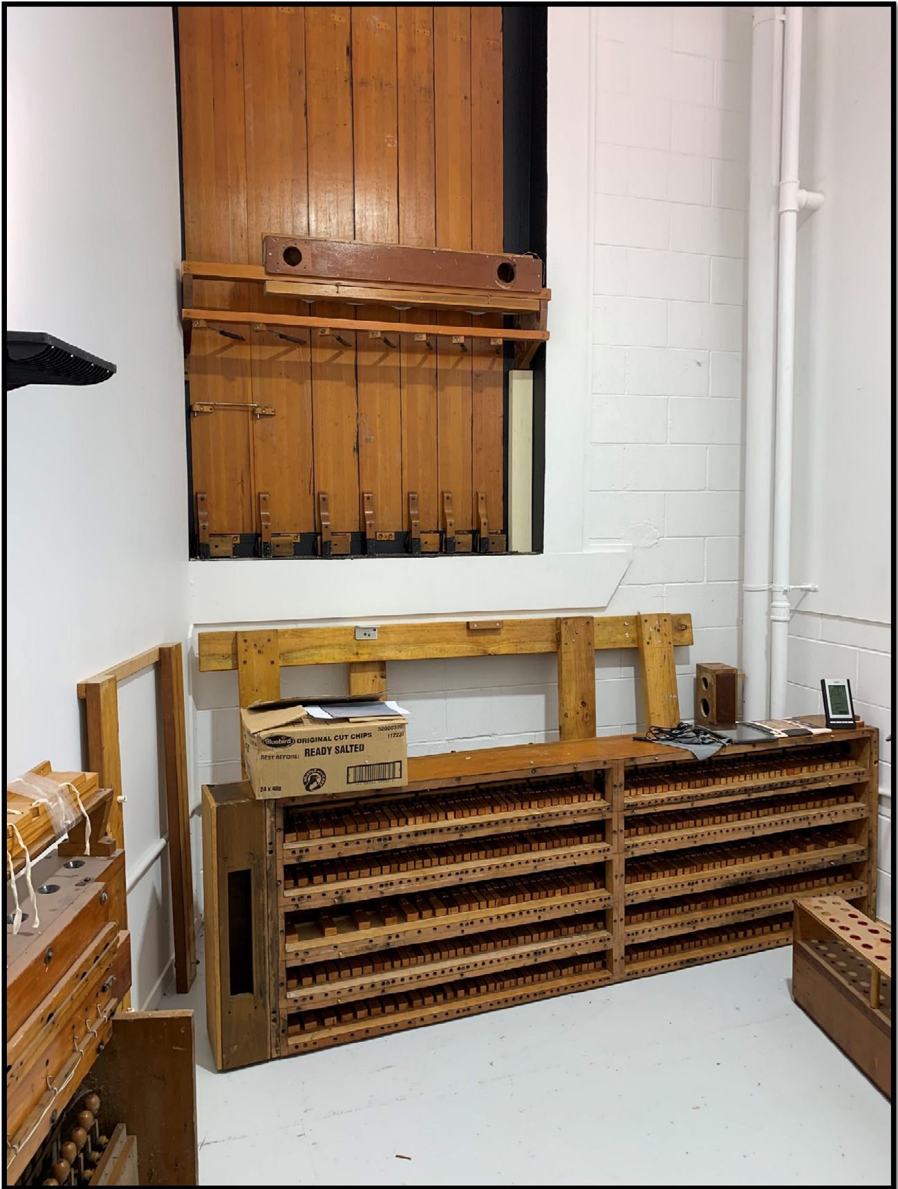
"Main Chamber" with swell shutters in place and the chests coming in....