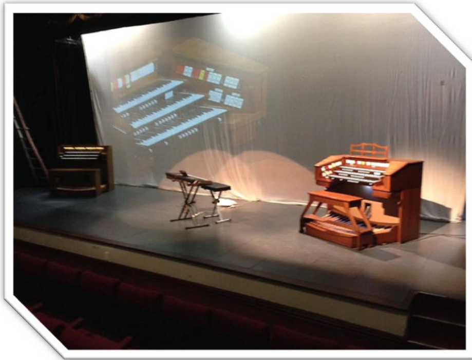
The Stage is set! Video on and Allen organs and Korg Keyboard in place